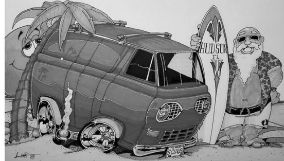
A WEEKEND AT THE MUSEUM (OF VANNING) Dec 6th-8th 2019

Due To Museum Space Limitations All Festivities Will Be Held At The Days Inn 10826 U.S. 19 Port Richey FL. 34668