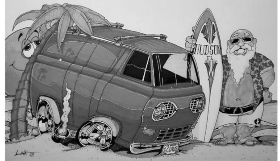
A WEEKEND AT THE MUSEUM (OF VANNING) Dec 6th-8th 2019

Due To Museum Space Limitations All Festivities Will Be Held At The Days Inn 10826 U.S. 19 Port Richey FL. 34668